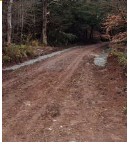
Parker Road D&G Project during construction.

They are now currently working on Brown's Road in Elkland Township and will continue to work until the weather shuts them down. All projects must be completed by June of 2010.