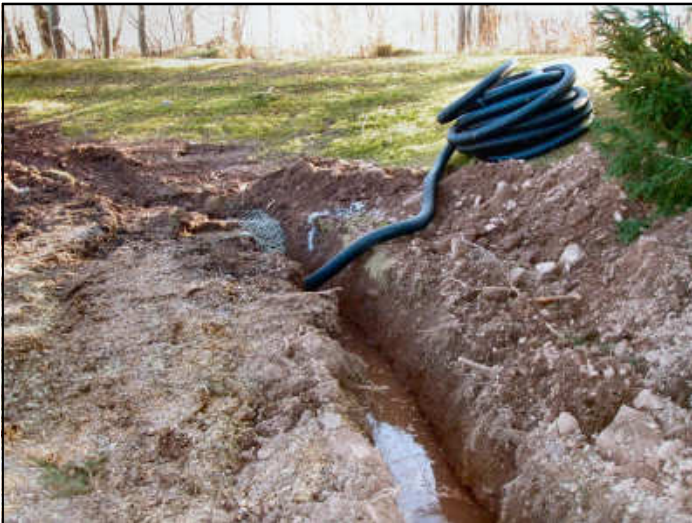
The photo to the left is of preliminary work completed on the lower parking lot at the county Agricultural Resources Center. Subsurface drainage has been installed from the Head Start playground to the lower edge of the parking lot. The project will be completed in 2010 and include resurfacing of the parking lot. Funding for the project is being provided through Sullivan County CDBG funds.