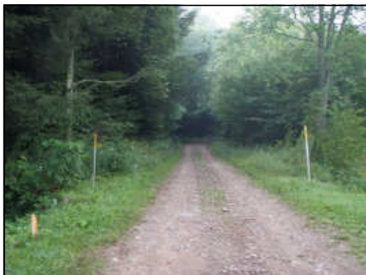
Photos of the Parker Road Project funded through the ARRA Grant.