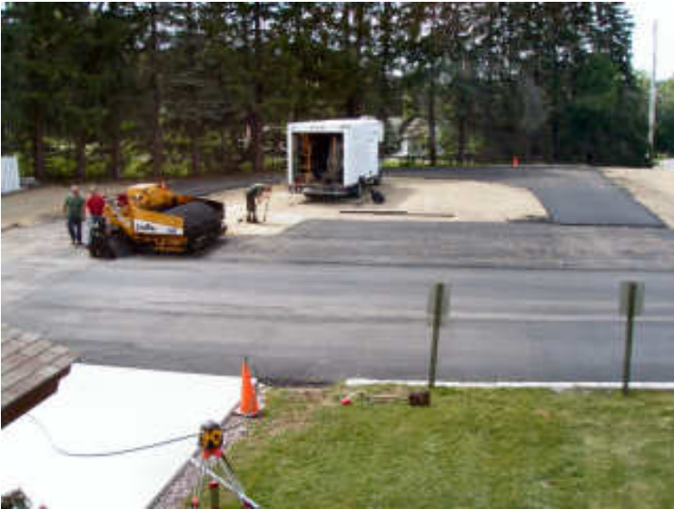
T. Brennan of Carbondale working on the final coat of paving for the driving area.