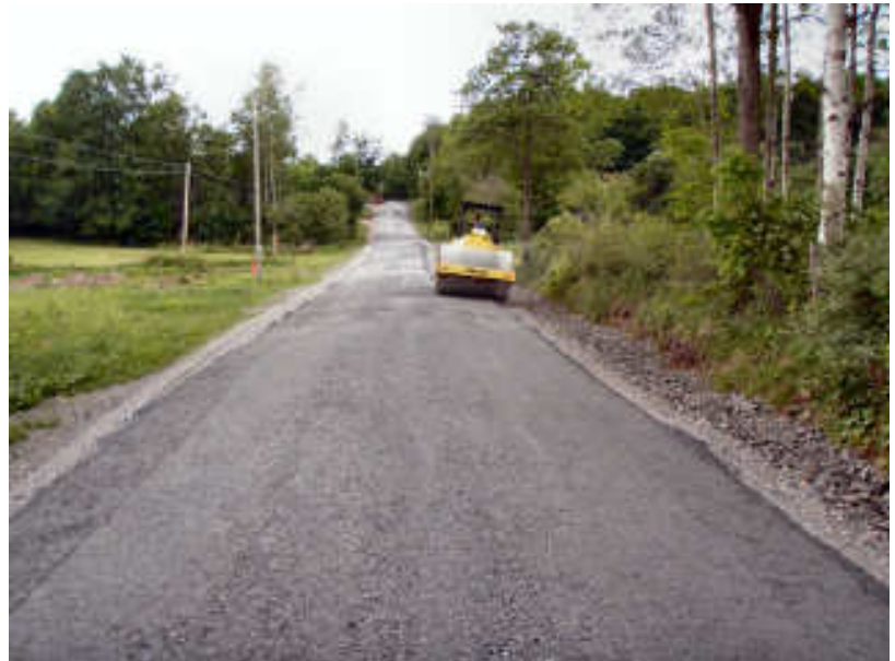
Insinger Excavating compacting DSA (Driving Surface Aggregate) for ARRA project on Warburton Hill Road, Forks Township.