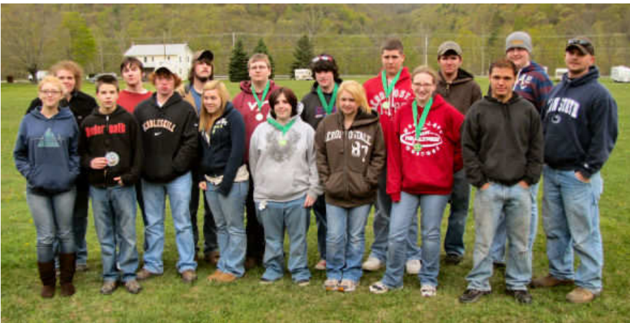
This group of students participated in the 2010 local county envirothon held in conjunction with Lycoming County. The top team, shown wearing green ribbons, represented the county at the PA Envirothon held on May 26 at PPL Montour Preserve.